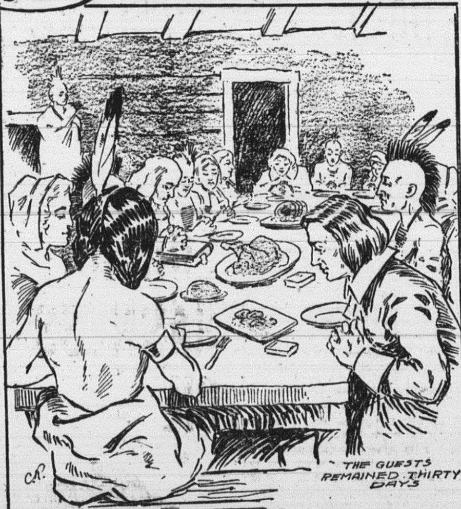
THE GUESTS REMAINED THIRTY DAYS

Thanksgiving day is peculiarly an American custom, though there are some writers who claim that it is not possible to determine the date of the first observance. John A. Goodwin, in his historical review, "The Pilgrim Republic," is positive, however, that the first celebration occurred in the fall of 1621, this being followed in 1623 by the first Thanksgiving proclamation, by the governor of Massachusetts. In 1630 there arrived at Plymouth 14 vessels, bringing with them 880 colonists, making the number nearly 1,200 instead of a mere 300. On July 8, 1630, another Thanksgiving was held in acknowledgment for this accession to the ranks of the colonists. The Dutch governors of the New